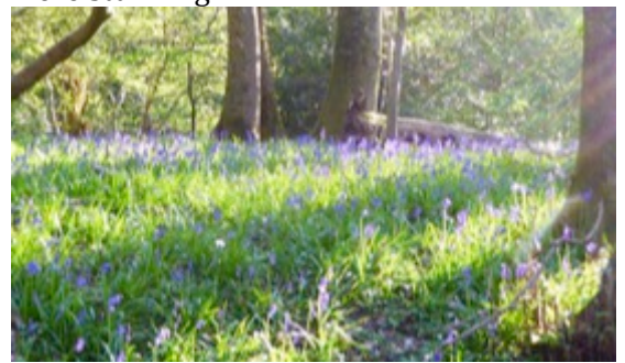
June: Sussex Wildlife and Forest School

We started to see evidence of the yellow rattle in our efforts towards creating wild flower areas along the bank and in the meadow, and the bluebells in the wood were stunning.